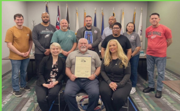
Photo of Reps. White, Grim presenting a commendation to the Lucas Co. Veterans Commission.