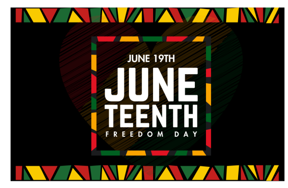
Happy Juneteenth from the Ohio House Democrats!

On National Children's Day, we reflect on the challenges many children around our state and country face. We need to ensure our children have access to a quality public education, food on the table, and a future to be hopeful about.