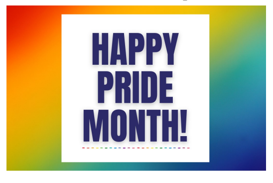
Happy Pride Month from the Ohio House Democrats!