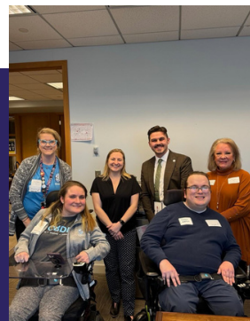
Developmental Disabilities Advocacy Day meeting with constituents.