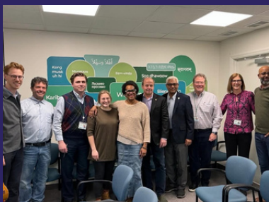
Community Refugee and Immigration Services (CRIS Ohio) tour with my Franklin County colleagues.