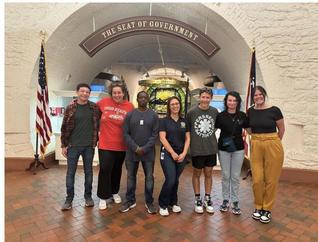
Greeting OSU Students before a tour of the Statehouse