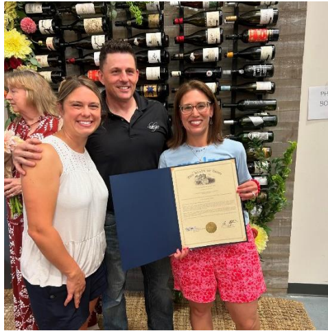
Grand Reopening of Griffins Floral in New Albany