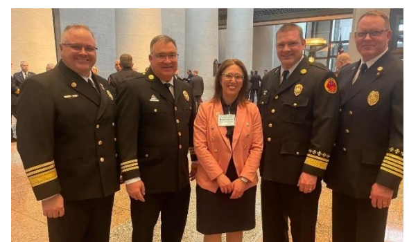
Reception for Ohio Fire Chiefs