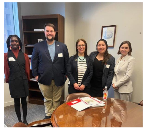
Meeting with Miami University Students