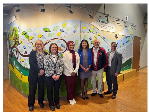
Tour of Childhood League Center