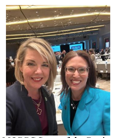
MORPC State of the Region