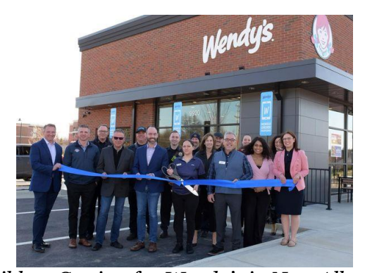
Ribbon Cutting for Wendy's in New Albany