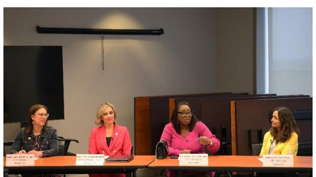
Panel for Women's History Month