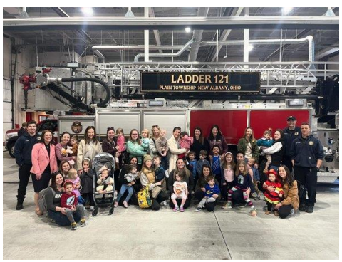
Plain Township Fire Station Tour