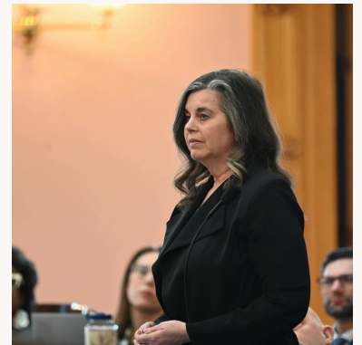
I was honored to speak up for Senate Bill 1 during session this month.