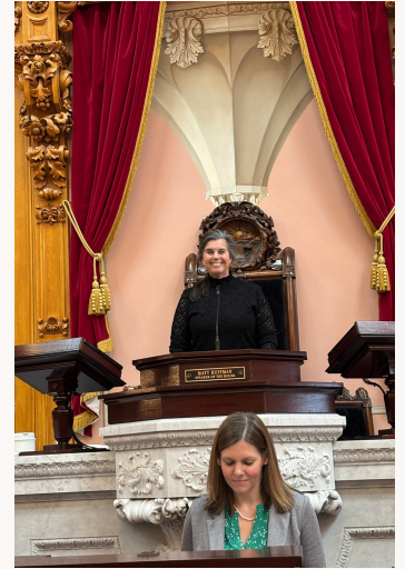
I got to be Speaker of the House for a day during one of our non-voting sessions!

In the budget, I introduced a number of things, such as: return $1.5 billion to low income homeowners to offset massive property tax increases, foster care veto authority, and a number of cuts to spending. 2025 has already proven to be challenging, but we'll handle it together.