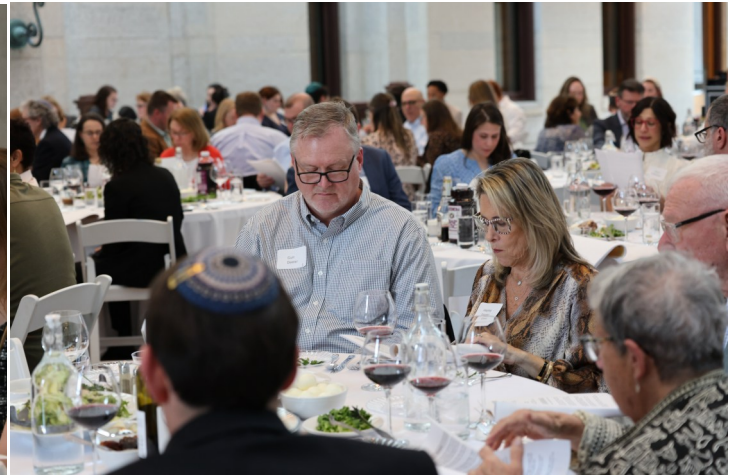
Guests from across the state participate in the 15 steps of the Seder together in the Statehouse Atrium.