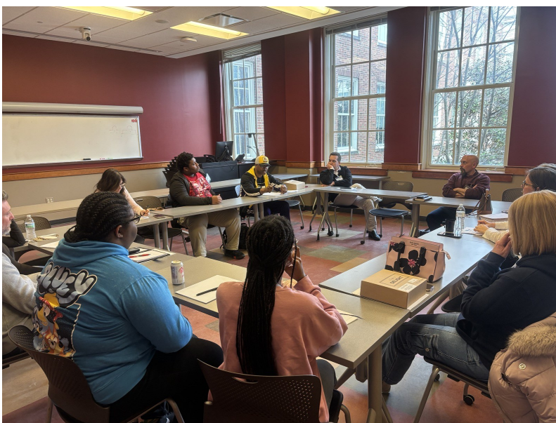
Breakout group discusses issues important to public education in both urban and Appalachian areas of the state.

That shared mission makes collaboration between urban and Appalachian districts not only valuable, but essential to the future of public education. When leaders, teachers, and students from these communities come together, they can learn from one another's experiences, share innovative solutions, and advocate for policies that work for schools across the state.