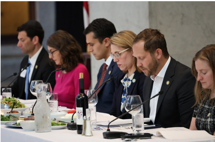
Members of the Ohio Jewish Caucus leading the Statehouse Seder.