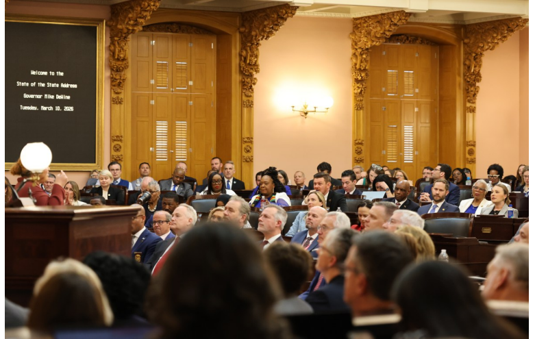
The Ohio House and Senate Democratic members sit for Governor DeWine's last State of the State address.