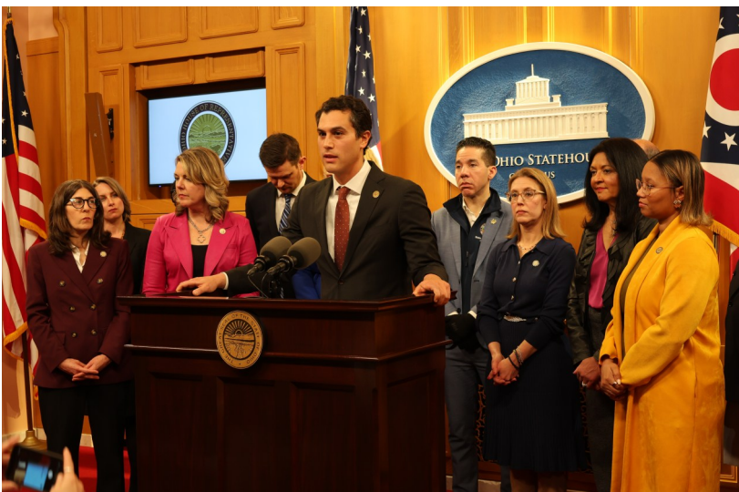
Leader Isaacsohn and members of the Ohio House caucus gather to discuss bills to safeguard communities from I.C.E. enforcement.

House Democrats continue to put forward legislation that supports community safety, upholds civil rights, and provides clarity and stability for local residents, schools, and law enforcement partners. Watch the press conference here .