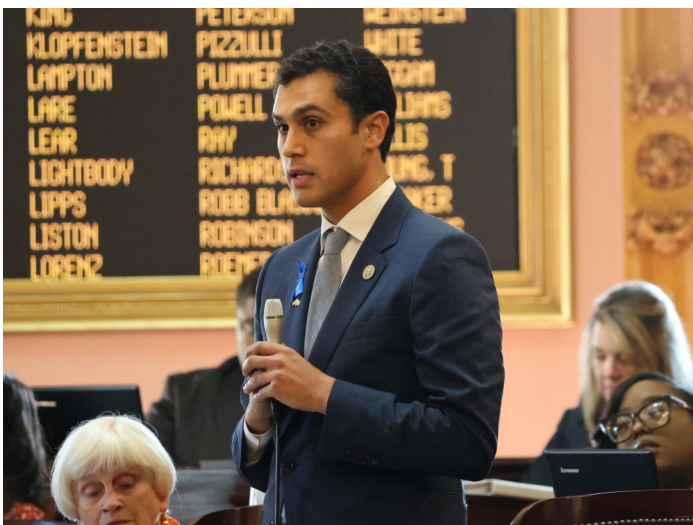
Rep. Isaacsohn expressing his support for the Israeli people and condemning recent terrorist attacks during House Session on October 10 th .

On October 10 th , I introduced a resolution supporting the people of Israel and condemning recent terrorist attacks by Hamas.