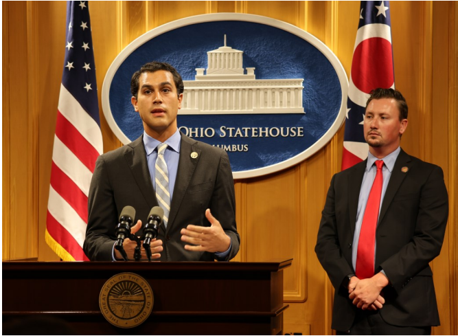
Rep. Isaacsohn and Rep. Hall at a press conference following the introduction of HB 263.

My office has heard from numerous constituents concerned about their sharply-rising property taxes. One solution I have offered, HB 263, would freeze property taxes for eligible seniors.