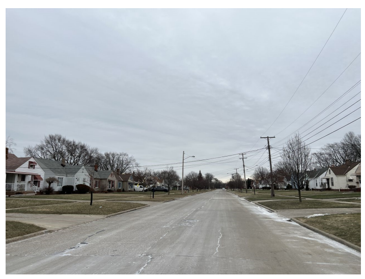
Archmere Avenue

<u>Click here</u> to read more about the project.