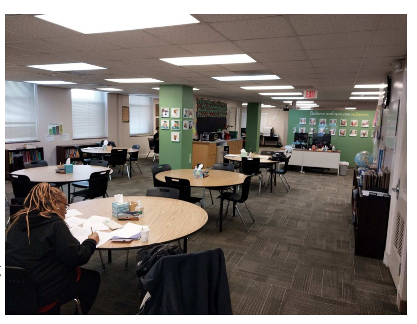
Seeds of Literacy WEST location

This impressive program and the professionals who operate it are helping build brighter futures for their students, including collaboration with potential employers. For more information, their website is www.seedofliteracy.org.