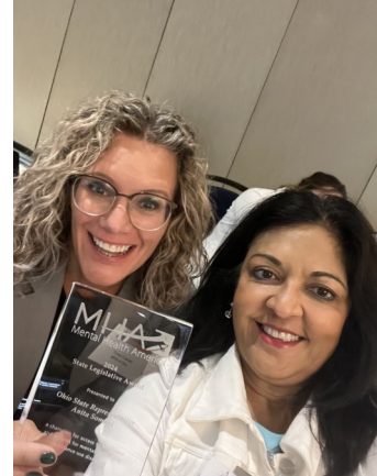
I received a State Legislative Award from Mental Health American at their awards breakfast this month!