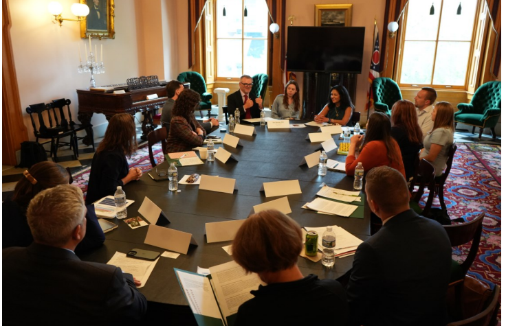
I had a roundtable discussion with the 2024-2025 Osteopathic Health Policy Fellows class. It was wonderful to speak with such talented and involved fellow physicians.