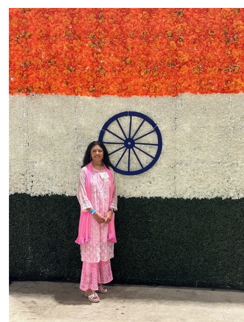
It was a privilege to speak at the India Independence Day Festival. India has one of the largest democracies of the world.