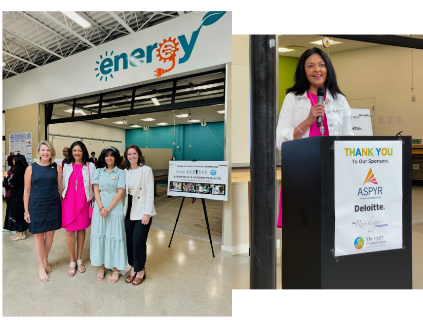
It was an honor to speak to the interns in the Power Up Your Potential Program. They had the chance to use their STEM skills in the real world this summer!