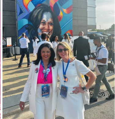
The DNC was one of the most memorable experiences and one of the best organized events I have ever attended!