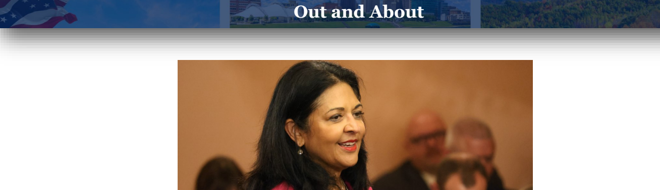
Behavioral Health Committee on May 7th.

Podcast, to discuss the importance of early screening and