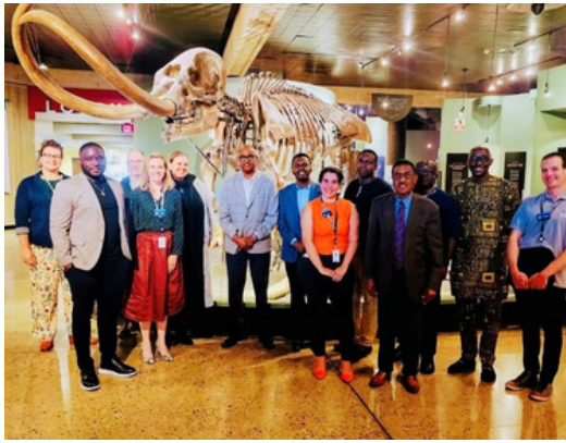
Meeting to discuss including New American Histories at the Ohio History Connection