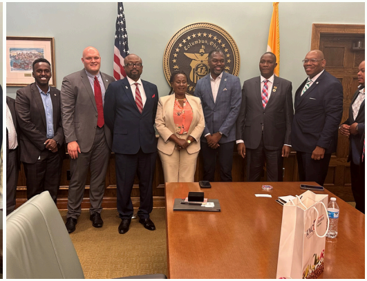
Discussing business initiatives with the Ohio Dept. of Development and Kenyan delegation