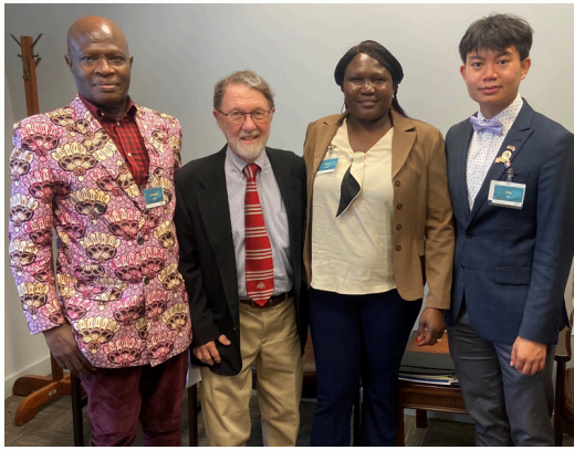
Learning and meeting with World Refugee Day advocates regarding HB 247