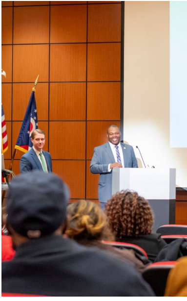
Listening to feedback from District residents