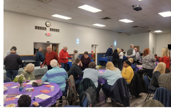
Polish dinner in Oregon, Ohio. The food was excellent!

The second full week of March is Ohio Agriculture Week. We appreciate and support Ohio's agricultural workers who keep our state fed and healthy. Ensuring our state can grow nutritious, affordable and sustainable food will allow us to remain competitive in the future.