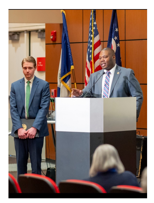
Fielding questions from attendees