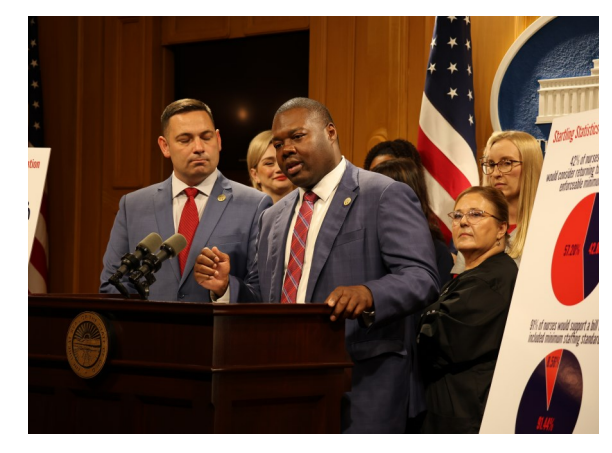
Introducing the Workforce and Safe Patient Care Act

If you have an upcoming event that our office should be aware of, please send us an email at rep44@ohiohouse.gov.