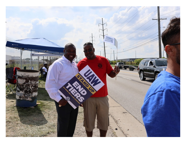
On the UAW picket line