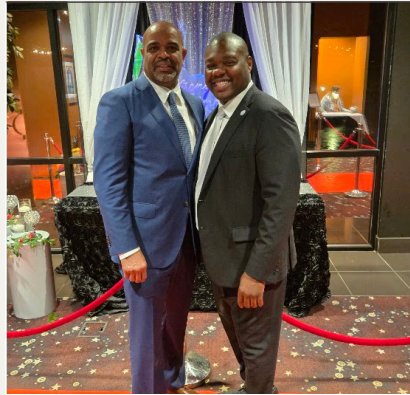
Man-Up, Stand-Up Founder