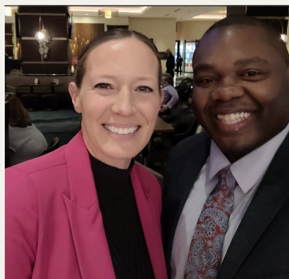
Council of State Governments