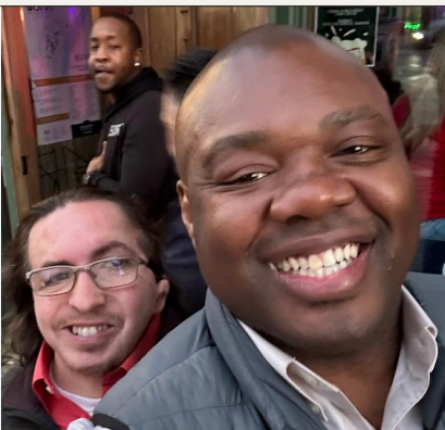
Toledo Farmers Market