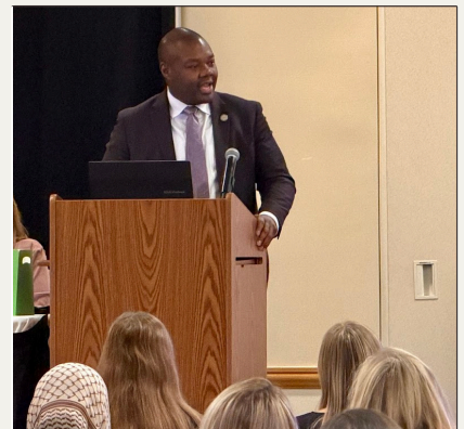
Delivering Speech About Affordable Healthcare