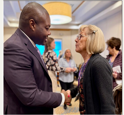
Senior Advocate for Affordable Healthcare