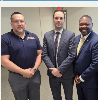
US-Canada NWO Building Trades Meeting