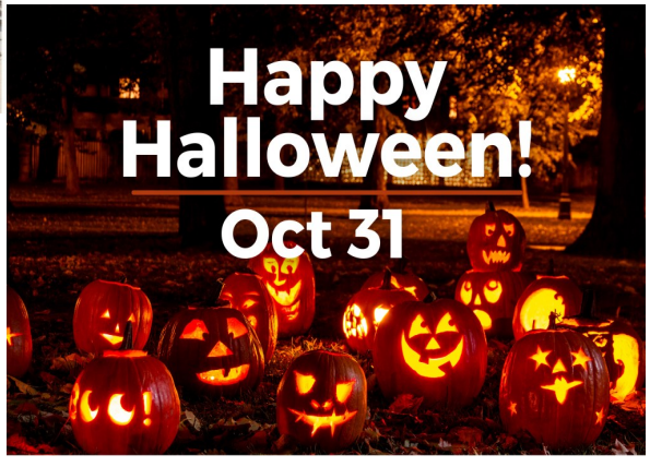
Happy Halloween from Ohio House Democrats!