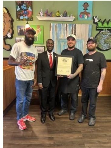
The Ugly Duckling Restaurant 1430 E 5th St, Dayton, OH 45402

Come check out these great new businesses and remember to eat and shop local!