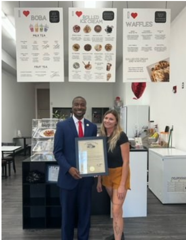
I Heart Ice Cream 9 N Williams St, Dayton, OH 45402