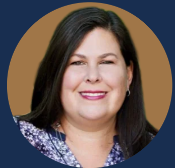
Monique Lampke Bexley City Councilwoman