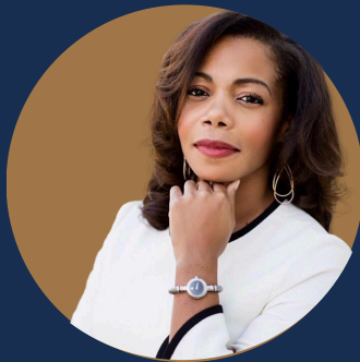
Commissioner Erica C. Crawley Commissioner of Franklin County