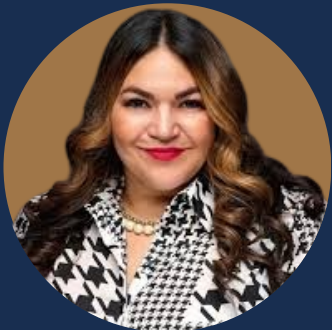
Lourdes Barroso de Padilla Columbus City Councilwoman