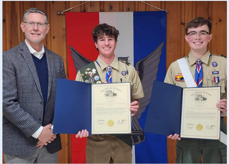
Commendations for recent Eagle Scouts.

If you think you or someone you know would qualify for a commendation from my office, please reach out through email at Rep53@ohiohouse.gov or through phone at 614-466-5141 . I would love to recognize even more members of the community for all of your accomplishments!