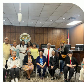
Woodmere Senior Citizen Brunch