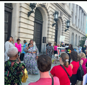
2nd Anniversary of the Dobbs Decision