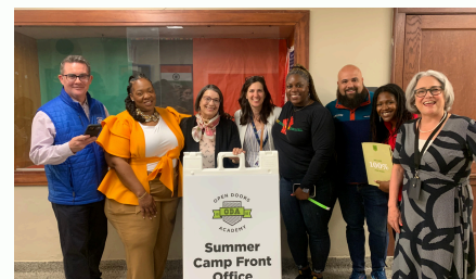
Open Door Academy