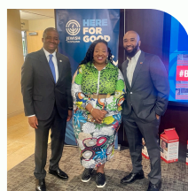
Jewish Federation Public Officials