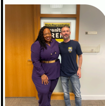
United Steel Workers