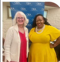
Ohio Education Association