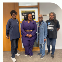
Ohio Federation of Teachers