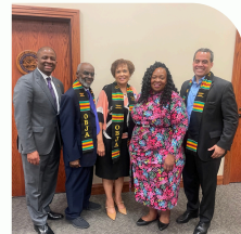
Ohio Black Judge Association