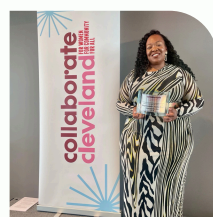
Collaborate Cleveland Change Maker Award