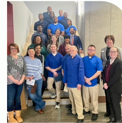
Lutheran Metropolitan Ministry