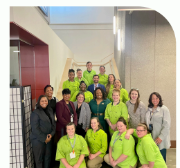
Lutheran Metropolitan Ministry