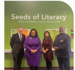
Seeds of Literacy