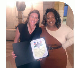
Judge Kira Krivosh Cuyahoga Court of Common Pleas