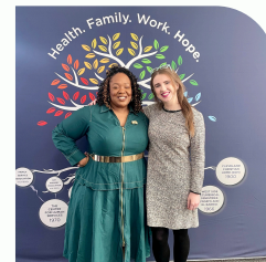
The Centers For Families & Children