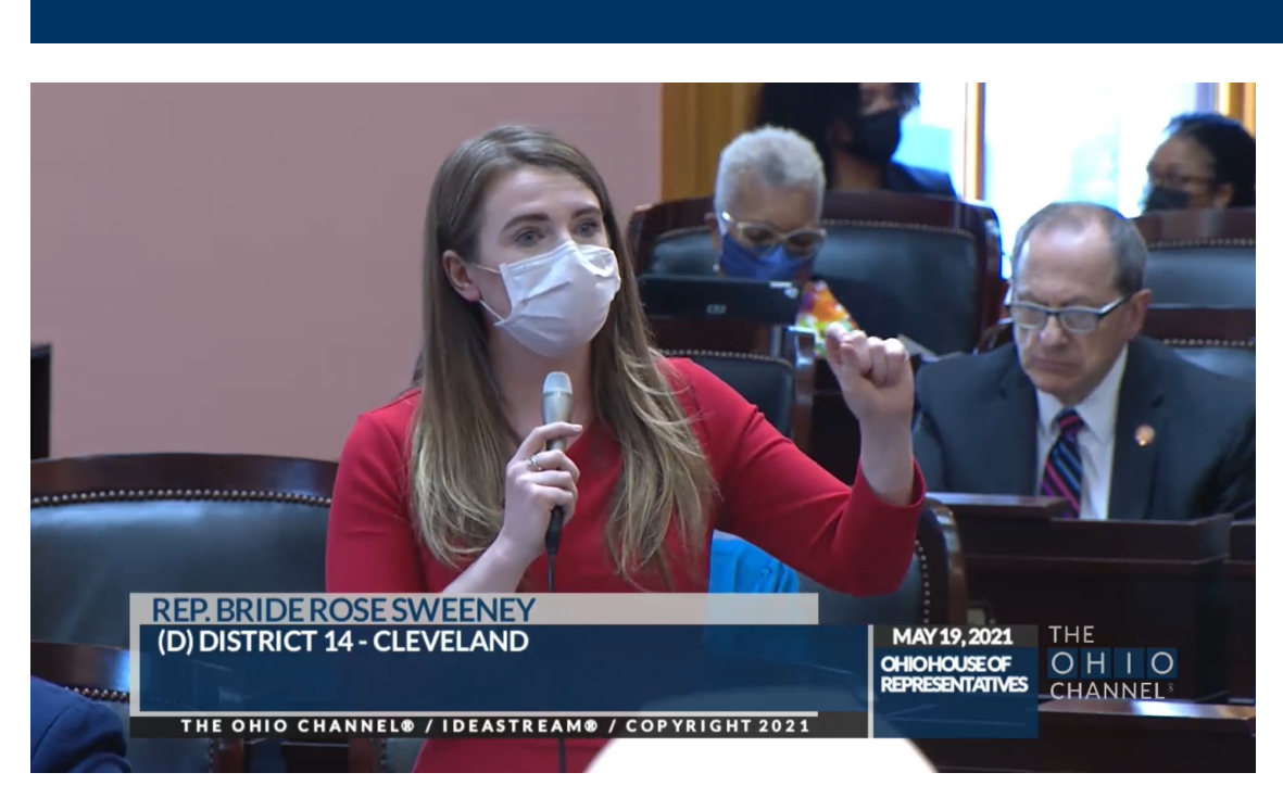
Pictured: Speaking on the floor of the Ohio House of Representatives in support of my bipartisan bills.

I was recently able to pass three of my bipartisan bills through the Ohio House of Representatives in one day. As a member of a superminority party, I feel extremely fortunate to have accomplished this feat. You can learn more about those bills below!